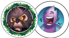
Face down Cards

Each player starts the game with two points, turning their Scoring card to let the 2 appear at the top of the card. Then deal to each player one Monster and one Reaction card, face down.