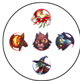
20 Fear cards