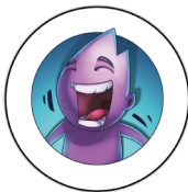
10 Reaction cards