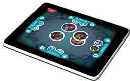
Tablet only mode