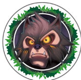
10 Monster cards

The game contains 50 cards divided in 4 decks :