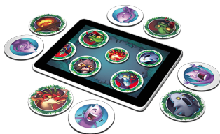
Cards and Tablet mode

Play FEARZ! on your smartphone or tablet ! Download the game on the App Store or Google Play .